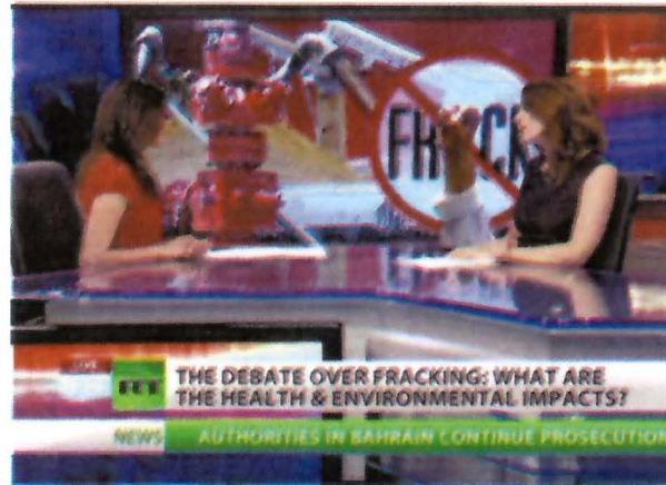
RT anti-fracking reporting (RT, 5 October)