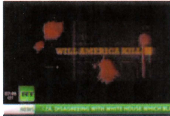
RT new show "Truthseeker" (RT, 11 November)