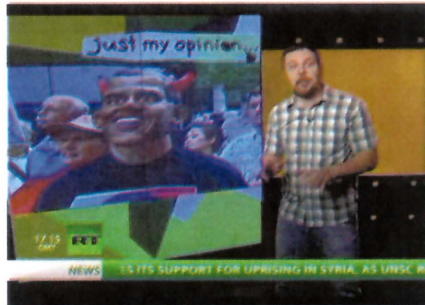
Messaging on RT prior to the US presidential election (RT, 3 November)