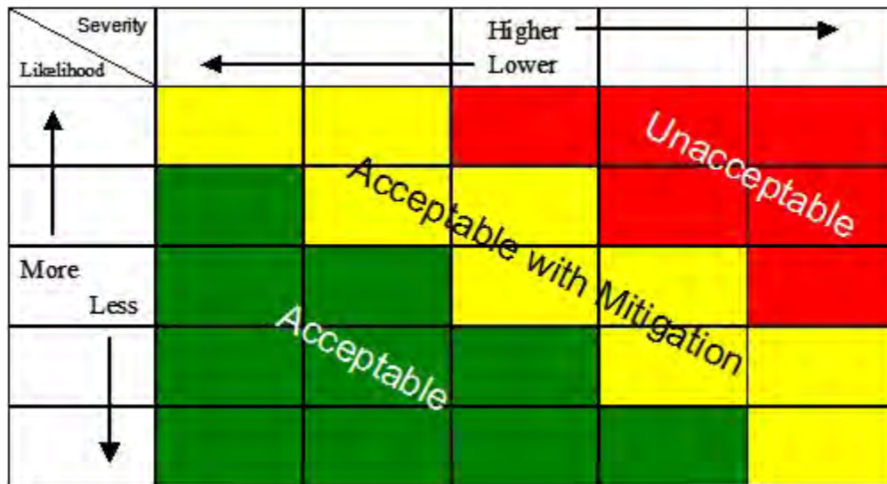
Figure A-2. Safety Risk Matrix Examples

A.5.1.3 Acceptable with Mitigation (Yellow). Where the risk assessment falls into the yellow area, the risk may be accepted under defined conditions of mitigation. An example of this situation would be an assessment of the impact of an sUAS operation near a school yard. Scheduling the operation to take place when school is not in session could be one mitigation to prevent undue risk to the children that study and play there. Another mitigation could be restricting people from the area of operations by placing cones or security personnel to prevent unauthorized access during the sUAS flight operation.