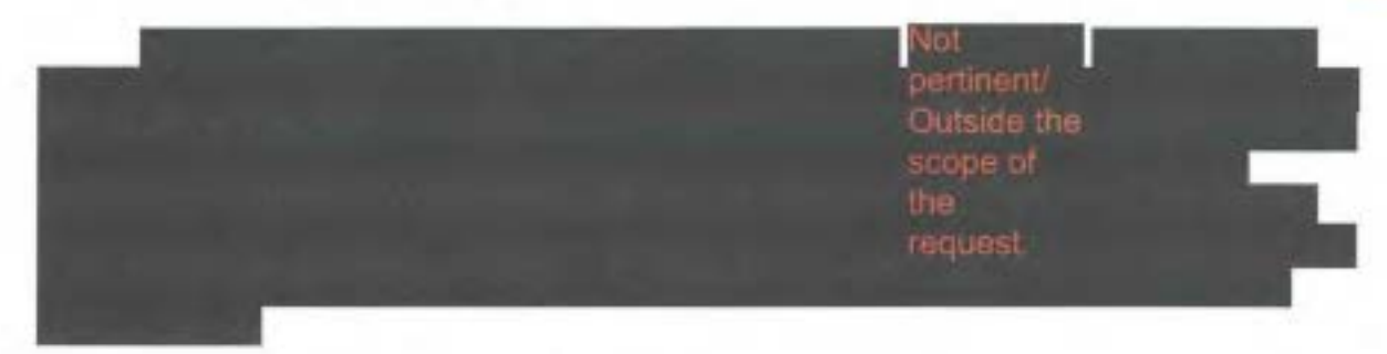
Highlights of the July 1 - December 31, 2009 Reporting Period (U)

This report is submitted pursuant to sections 108(a), 306, and 406, of the Foreign Intelligence Surveillance Act of 1978 (FISA or the Act), as amended, 50 U.S.C. §§ 1801-1812, 1821-1829, 1841-1846, 1861-1862, 1871, 1881-1881g, 1885-1885c. It includes information concerning electronic surveillance, physical searches, pen register/trap and trace (PR/TT) surveillance, and requests for access to certain business records for foreign intelligence purposes conducted under the Act by the Federal Bureau of Investigation (FBI), the Central Intelligence Agency (CIA), and/or the National Security Agency (NSA) during the period July 1, 2009 through December 31, 2009. Consistent with the Department of Justice's (DOJ's) efforts to keep Congress fully informed of FISA activities in a manner consistent with the national security, this report contains information beyond that required by the statutory provisions set forth above. (S)