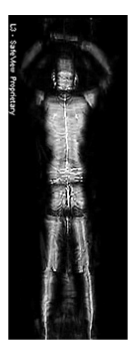
Millimeter wave image

While the equipment has the capability of collecting and storing an image, the image storage functions will be disabled by the manufacturer before the devices are placed in an airport and will not have the capability to be activated by operators. Images will be maintained on the screen only for as long as it takes to resolve any anomalies; if a TSO sees a suspicious area or prohibited item, the image will remain on the screen until the item is cleared either by the TSO recognizing the item on the screen, or by a physical screening by the TSO with the individual. The image is deleted in order to permit the next individual to be screened. The equipment does not retain the image. In addition, TSOs will be prohibited from bringing any device into the viewing area that has any photographic capability, including cell phone cameras. Rules governing the operating procedures of TSOs using this WBI equipment are documented in standard operating procedures (SOP), and compliance with these procedures is reviewed on a routine basis. Due the sensitivity of the technical and operational details, the SOP will not be publicized, however, TSOs receive extensive training prior to operating WBI technology.