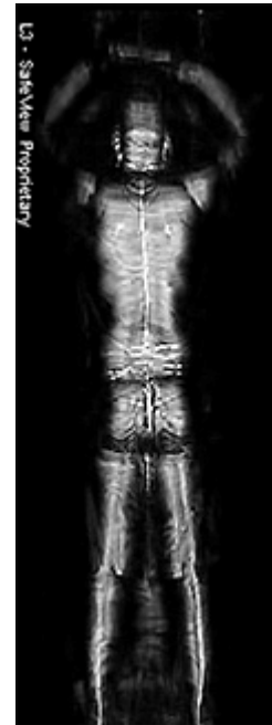
Millimeter wave image

While the equipment has the capability of collecting and storing an image, the image storage functions will be disabled by the manufacturer before the devices are placed in an airport and will not have the capability to be activated by operators. Images will be maintained on the screen only for as long as it takes to resolve any anomalies; if a TSO sees a suspicious area or prohibited item, the image will remain on the screen until the item is cleared either by the TSO recognizing the item on the screen, or by a physical screening by the TSO with the individual. The image is deleted in order to permit the next individual to be screened. The equipment does not retain the image. In addition, TSOs will be prohibited from bringing any device into the viewing area that has any photographic capability, including cell phone cameras. Rules governing the operating procedures of TSOs using this WBI equipment are documented in standard operating procedures (SOP), and compliance with these procedures is reviewed on a routine basis. Due to the sensitivity of the technical and operational details, the SOP will not be publicized, however, TSOs receive extensive training prior to operating WBI technology.