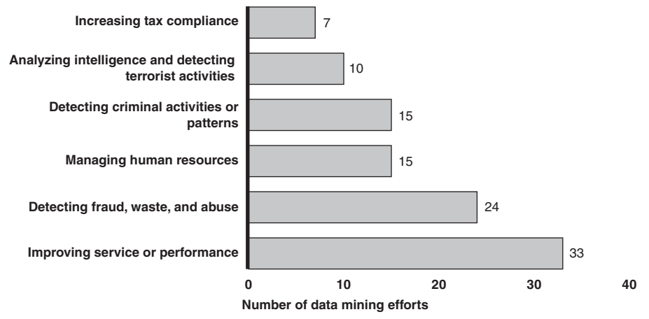
Figure 1: Top Six Purposes of Data Mining Efforts That Involve Personal Information Purposes

Overall, 122 of the 199 data mining efforts involve personal information. Figure 1 shows the top six purposes of these efforts, as well as their distribution.