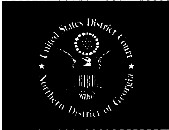
EXHIBIT / ATTACHMENT