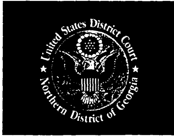
EXHIBIT / ATTACHMENT