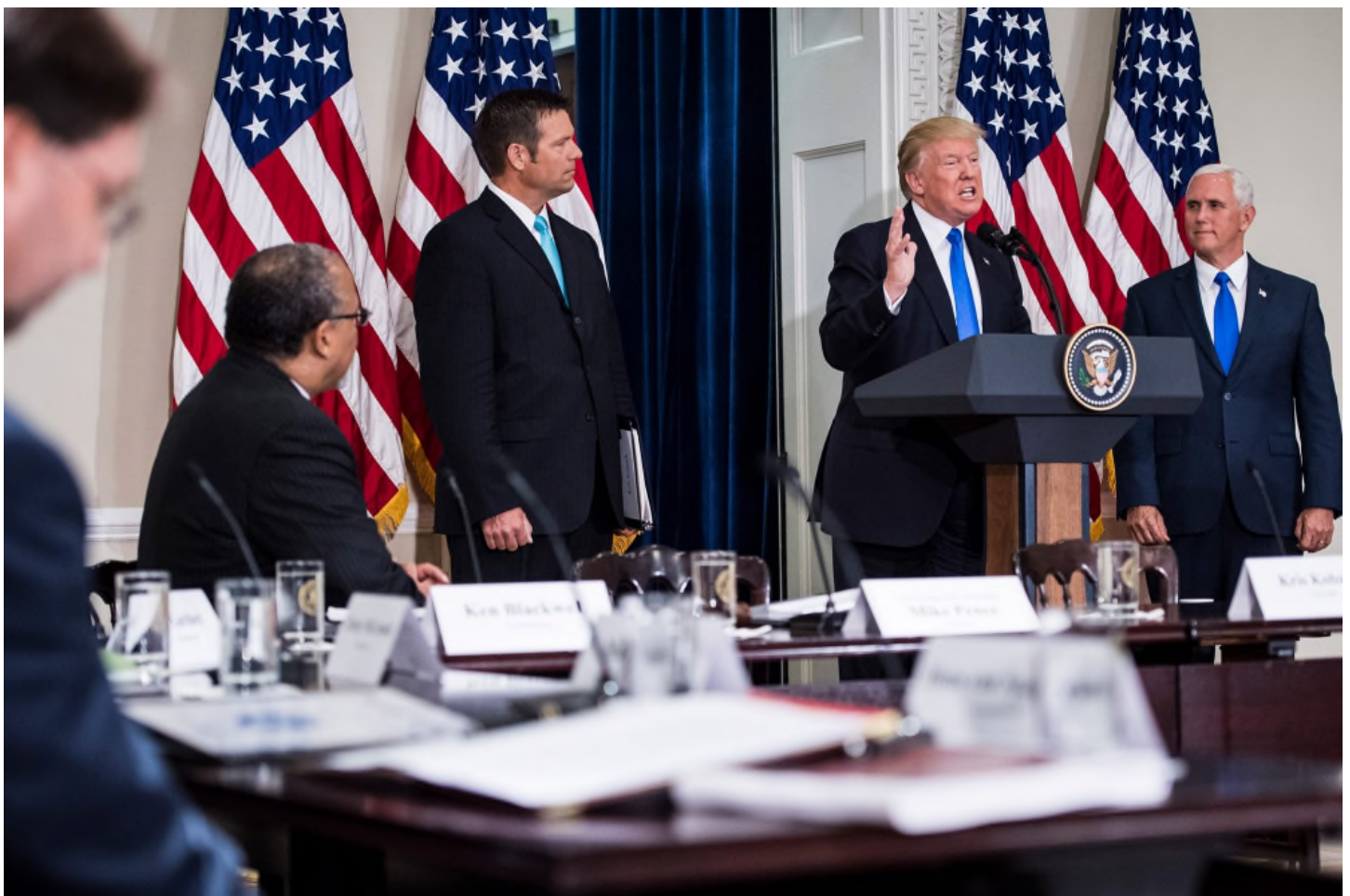
President Donald Trump, accompanied by Vice President Mike Pence and Kansas Secretary of State Kris Kobach, speaks at the first meeting of the Presidential Advisory Commission on Election Integrity at the White House on Wednesday, July 19.