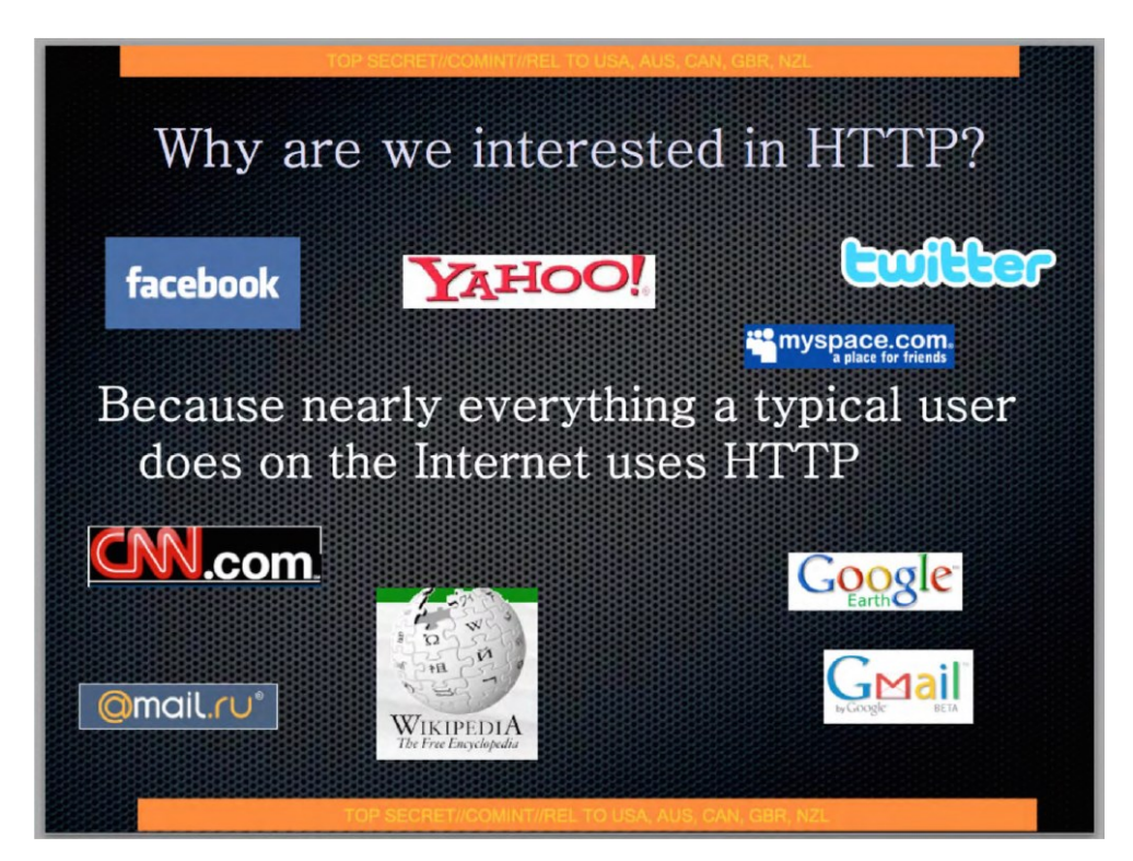
NSA slide published in The Guardian (JA.5: 3221)

And Wikimedia has taken reasonable but costly measures to mitigate the risk of Upstream surveillance of its communications. See JA.3: 2237-2242 (explaining implementation of costly new protocols to encrypt Wikimedia's communications, requiring several years' worth of employee work and an expenditure of more than $300,000). These injuries were driven by the revelations beginning in 2013 about the existence, breadth, and operation of Upstream surveillance, including the publication by the press of multiple NSA slides showing that the NSA was surveilling Wikimedia's communications. JA.5: 3221, 3246.