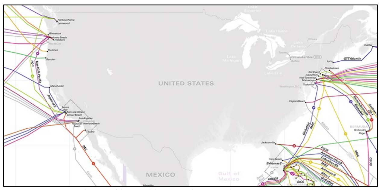
Undersea fiber cables (Bradner Decl. ¶ 201, JA.2: 992)

Each cable may carry a number of individual circuits, but the circuits connecting the U.S. to the rest of the world are few in number compared to the volume of Wikimedia's communications. Id. ¶¶ 200-28, 348 (JA.2: 991-1005, 1046-47). As Bradner observes, "even if there are thousands of international circuits, there would still be hundreds of millions of Wikimedia communications on the average circuit." Id.