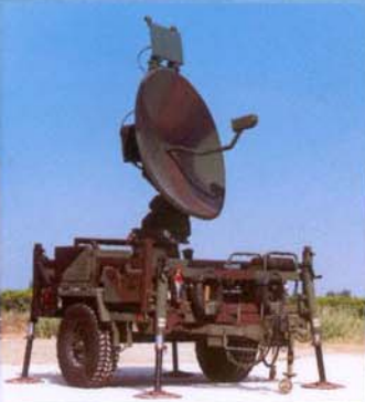
GDT - Ground Data Terminal