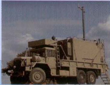
Mobile S-280 shelter